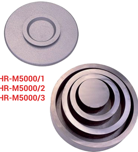
HR-M5000/1 HR-M5000/2 HR-M5000/3