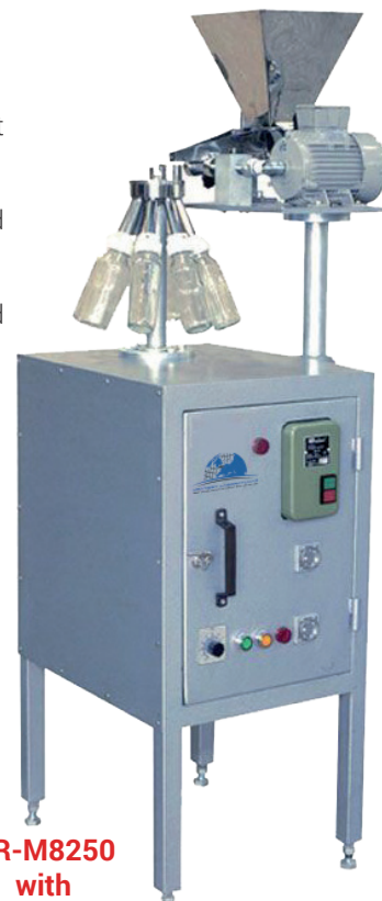
HR-M8250 with HR-M8250/1