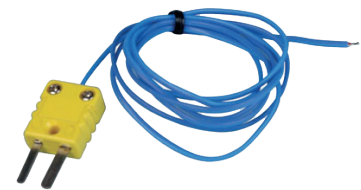
HR-C0960 with HR-C0961