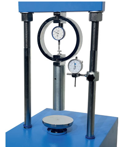
HR-AS0505/1 & HR-G5003 HR-S5000/1 & HR-G0876